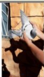
15240 ZAPRPC 19

Tel: +32468414450 * Cell: +27835643578 * E-Mail: boshoffmc71@gmail.com