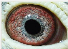
'Luke Donald' 3e Samdpr

'Luke Donald' Founding Stud Sire Gigi Gaddin Soetdoring Lofts